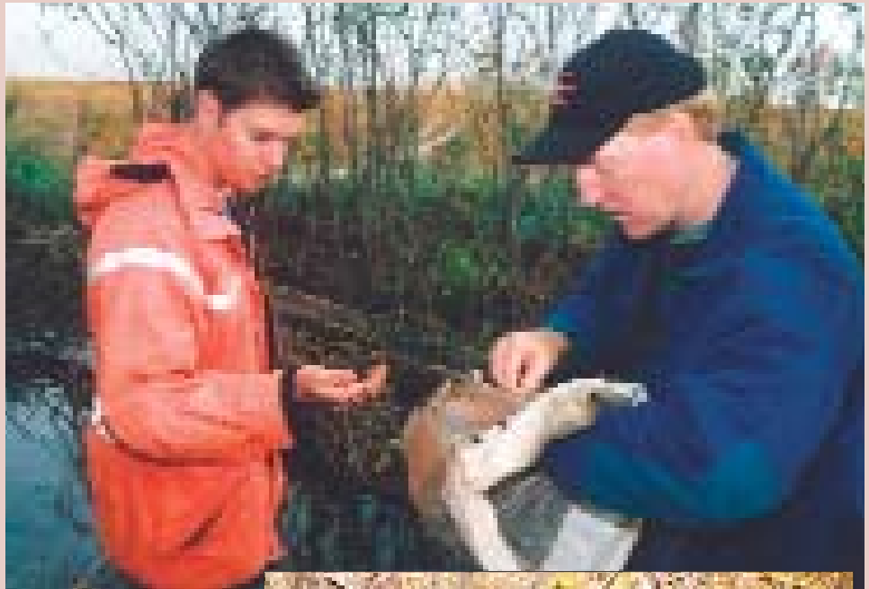
Members of the GTAA's Environment team study the area's rivers and streams for signs of fish habitat. The study will continue into next year as the Authority begins preparing for the Environmental Assessment.

Researchers have been collecting information on fish spawning areas through the creeks this fall. The remainder of the field data will be collected in the summer of 2004 to be consistent with methods undertaken by the Toronto Region Conservation Authority (TRCA) and Ontario Ministry of Natural Resources.