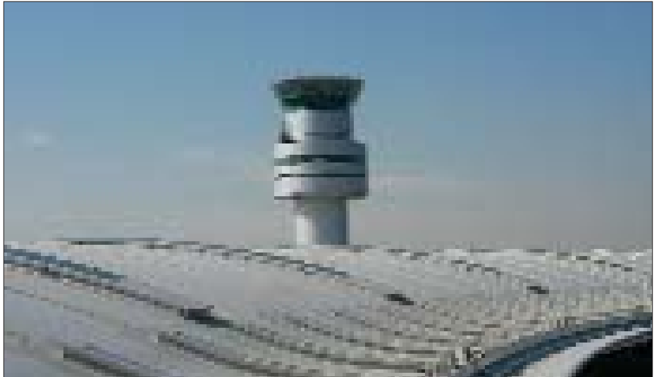
The GTAA's new Terminal 1 at Toronto Pearson International Airport is funded entirely by airport revenue, not Canadian taxpayers.

The mandate of the GTAA is to operate Toronto Pearson within a regional system of airports to enhance the economic growth and development of the Greater Toronto Area (GTA). In keeping with this regional development mandate, in 2001, the federal Minister of Transport asked the GTAA to undertake studies to determine the feasibility of a future airport on the federally owned Pickering lands.